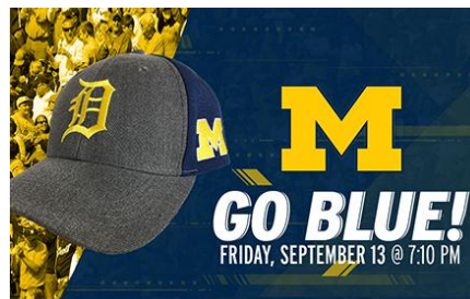
Graphic: Detroit Tigers

Buy tickets at tigers.com/um . For groups of 15 or more, email jessica.ruddy@tigers.com .