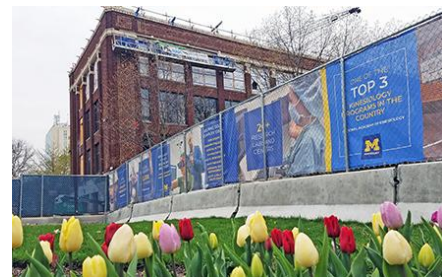
Springtime brings new fence graphics - and tulips! - to Kraus.