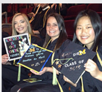
Three ecstatic graduates pose for a quick photo before the April Kinesiology commencement ceremony.