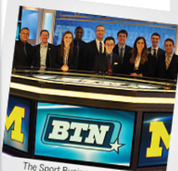
The Sport Business Association visited the Big Ten Network, Gatorade, and 120 Sports during their annual Chicago trip.